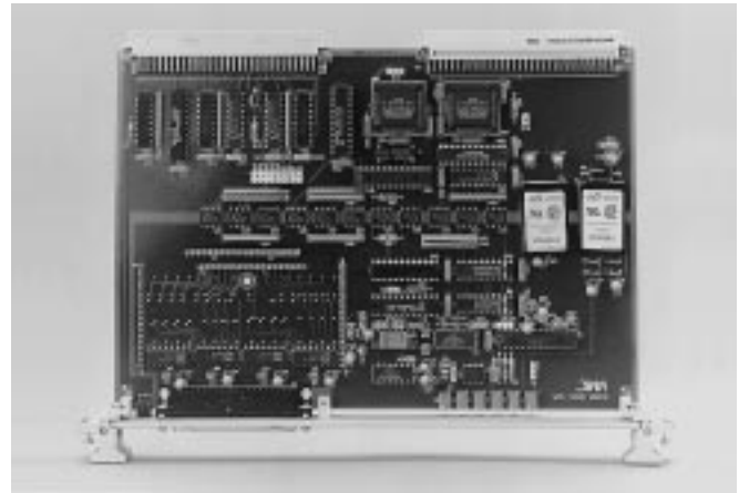
Figure 1 illustrates the internal functional organization of the VMIVME-3125 Board.

OPERATING MODE — All 16 or 32 input channels are scanned continuously at the maximum sampling rate, and the resulting data is stored in dual-ported Data Registers for VMEbus access. Scanning starts automatically after any reset operation, and no other programming is required to start the A/D conversion process.